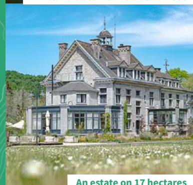
An estate on 17 hectares