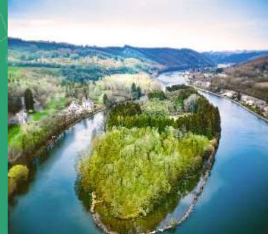
An island classified as Natura 2000