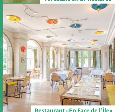
Restaurant «En Face de l'Île»