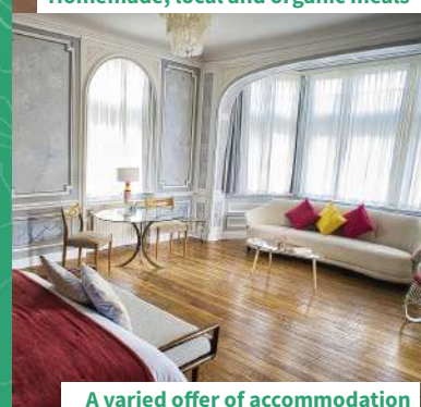
A varied offer of accommodation