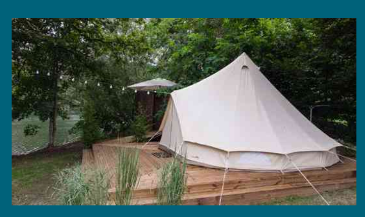
CHAMBRE MEUSE Sleeps 2 – 80 euro/night

The environment of Les Sorbiers, like any natural environment, has its beautiful sides but also certain risks. The banks of the Meuse and the proximity of water are some of these. Les Sorbiers invites all visitors to take the necessary precautions and follow the rules in place.